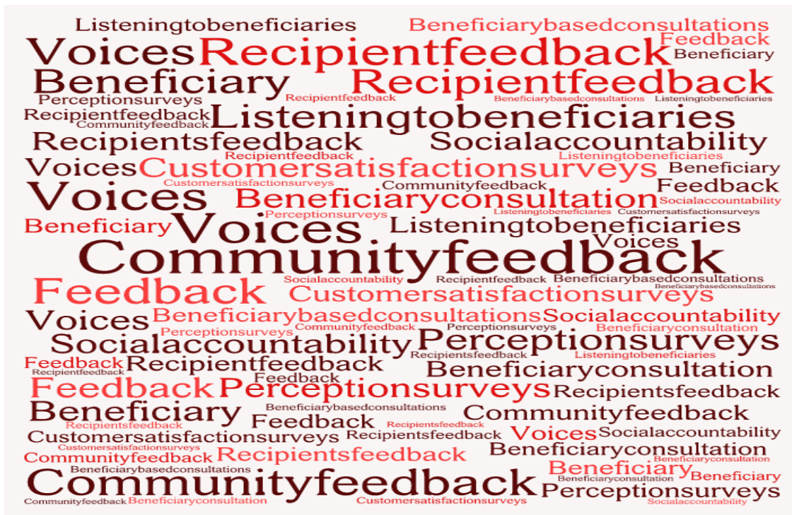
Figure 2: Word cloud of terms used interchangeably with 'beneficiary feedback'

For example, donors view beneficiary feedback as means of sharing experiences and information – from the people for whom projects are being implemented to the donors. Beneficiary feedback provides a channel to amplify voices of the beneficiaries and to connect decision-makers and citizens.