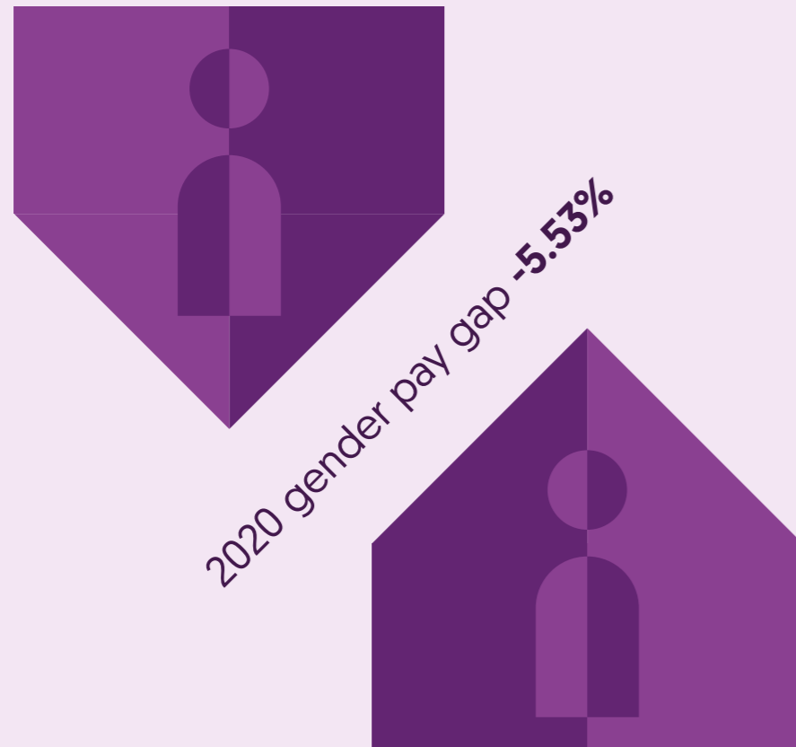
Gender pay gap [2020 mean gender pay gap of UK-based employees]

This means that on average women earn more than men at DI, which is because more women occupy senior-level positions.