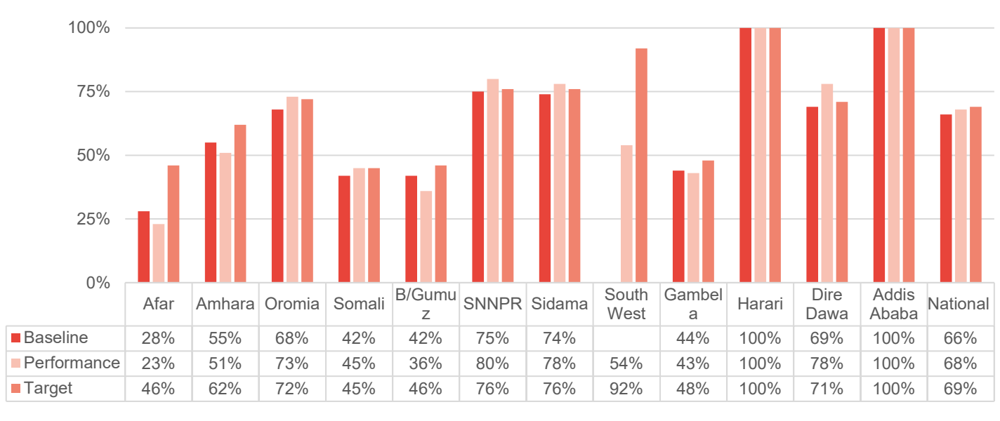
Figure 5: Regional performance in proportion of births attended by skilled health personnel, 2021/22

Source: Ministry of Health (2022) Annual Performance Report for fiscal year 2021/22 Notes: B/Gumuz = Benishangul-Gumuz; SNNPR = Southern Nations, Nationalities, and Peoples' Region.